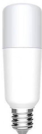
Ampoule LED15 Stik Tungsram - 220-240V - E27