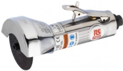
Meuleuse droite pneumatique RS Pro - 20000tr/min - BSP 1/4pouce Réf 739-8424