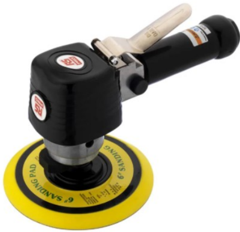
Ponceuse pneumatique orbitale RS Pro - 10000tr/min - BSP 1/4pouce Réf 739-8408