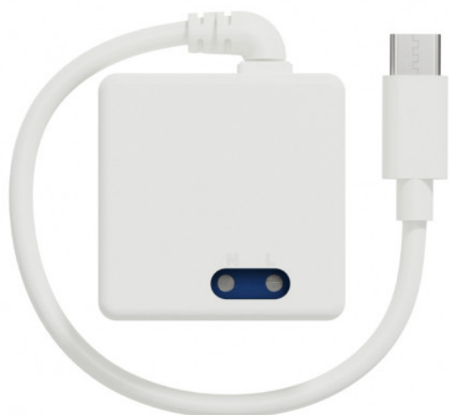
Alimentation murale HUB0 Schneider Electric - Génération 2 Réf CCT501800-0001