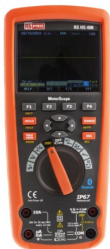
Multimètre numérique Meterscope RS-HS608 - 1000V - 10A - Portable Réf RS HS608